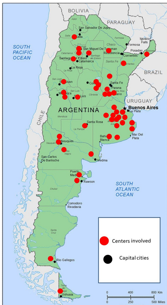
Fig. 2. States and centers involved in the registry.

be approved for its realization. The data contained in the Registry will be used in the research project and, in this way, the performance of various epidemiological studies employing the Registry’s information will also be encouraged.